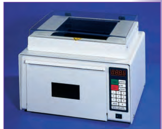
Translinker An ultraviolet blocking cover is included with the transilluminator.