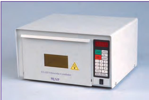
CL-1000 Crosslinker is an exposure instrument which uses shortwave UV energy to bond the DNA to a medium.

UVP Crosslinkers assure consistent UV output for many applications including DNA bonding and UV curing. UV crosslinking for attaching nucleic acids to a membrane for example, takes seconds as compared to oven baking. The crosslinkers utilize a microprocessor to control and measure the dose of UV radiation.